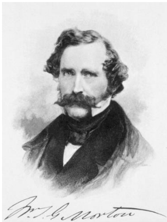
Dr. William T.G. Morton